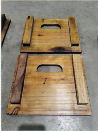
2 End Pieces