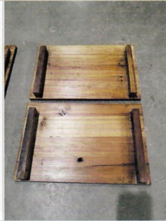
2 Side Pieces